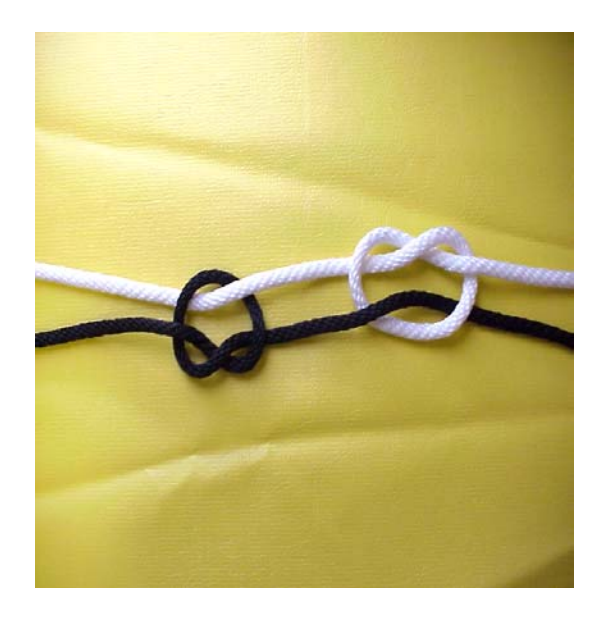
Step 1 – Create two overhand knots.